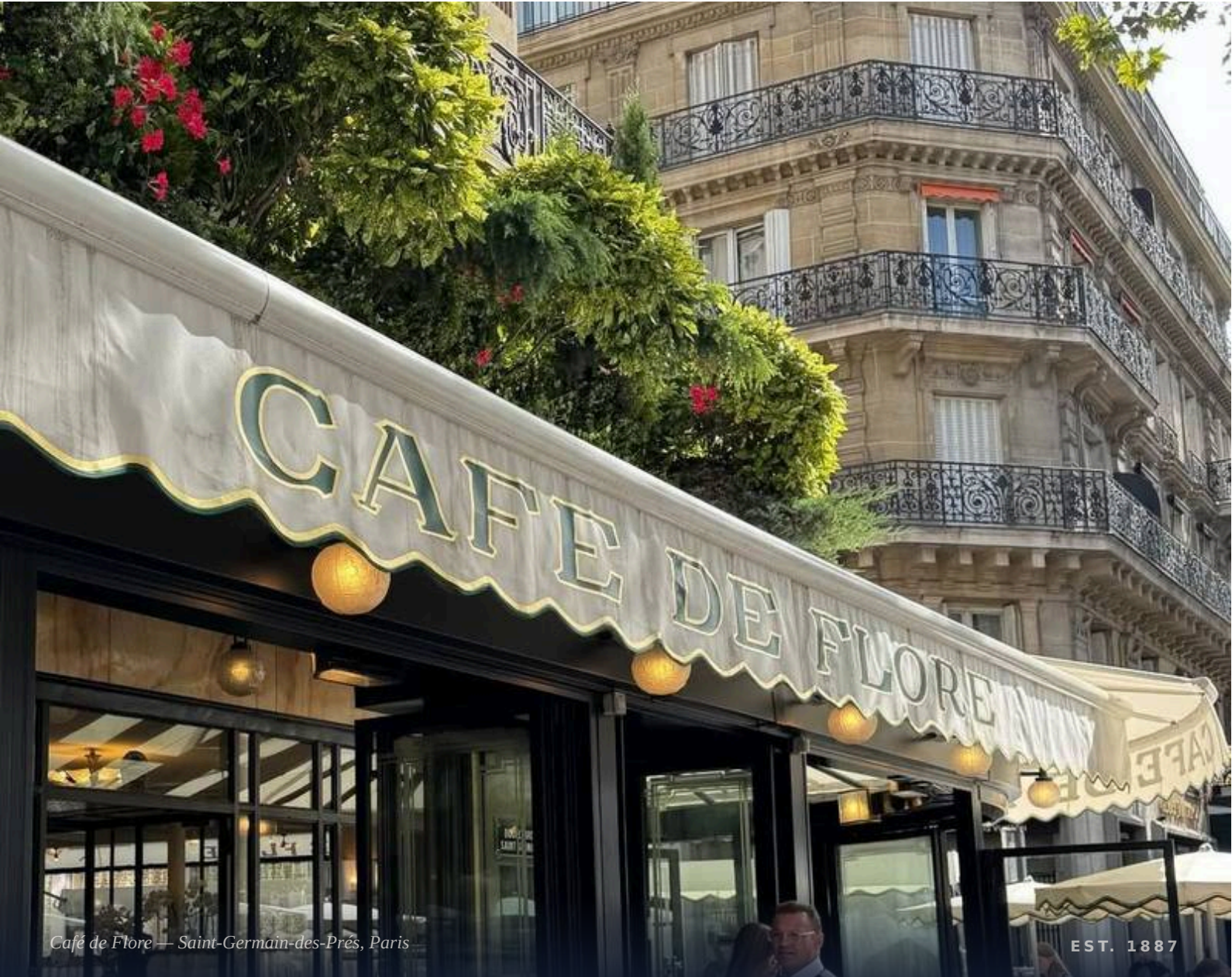
Café de Flore — Saint-Germain-des-Prés, Paris