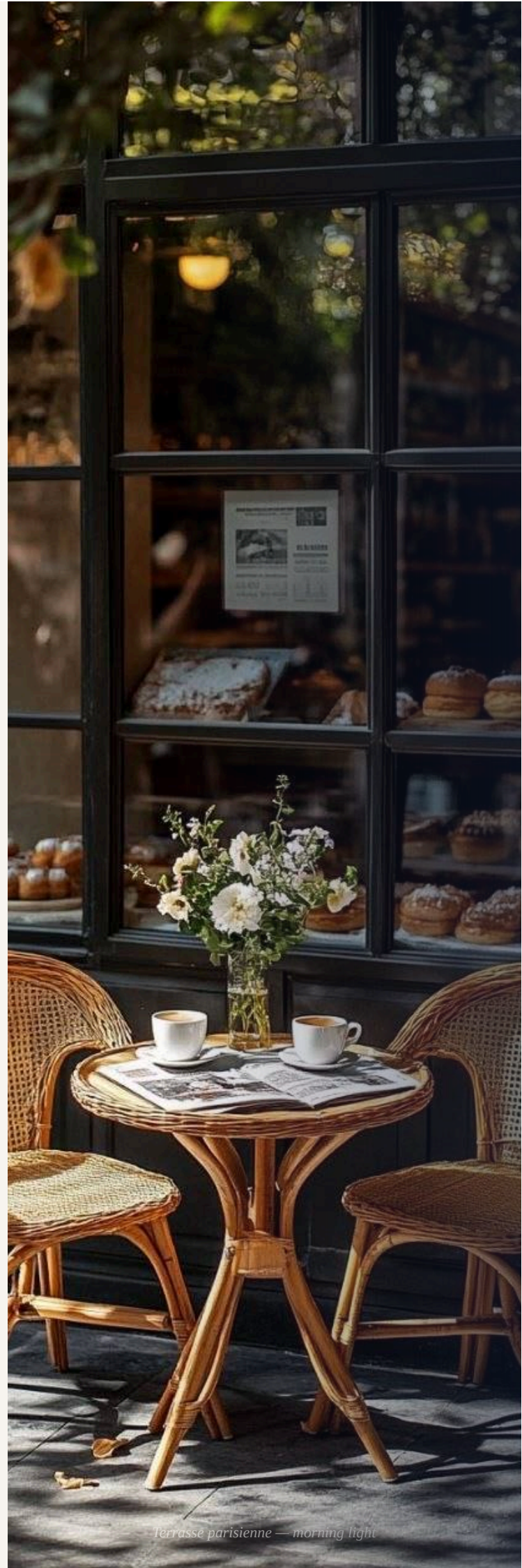
terrasse parisienne — morning light

Quality over quantity. A café in Paris is not about volume — it's about the ritual. If you want another, simply order one. The waiter won't be surprised.