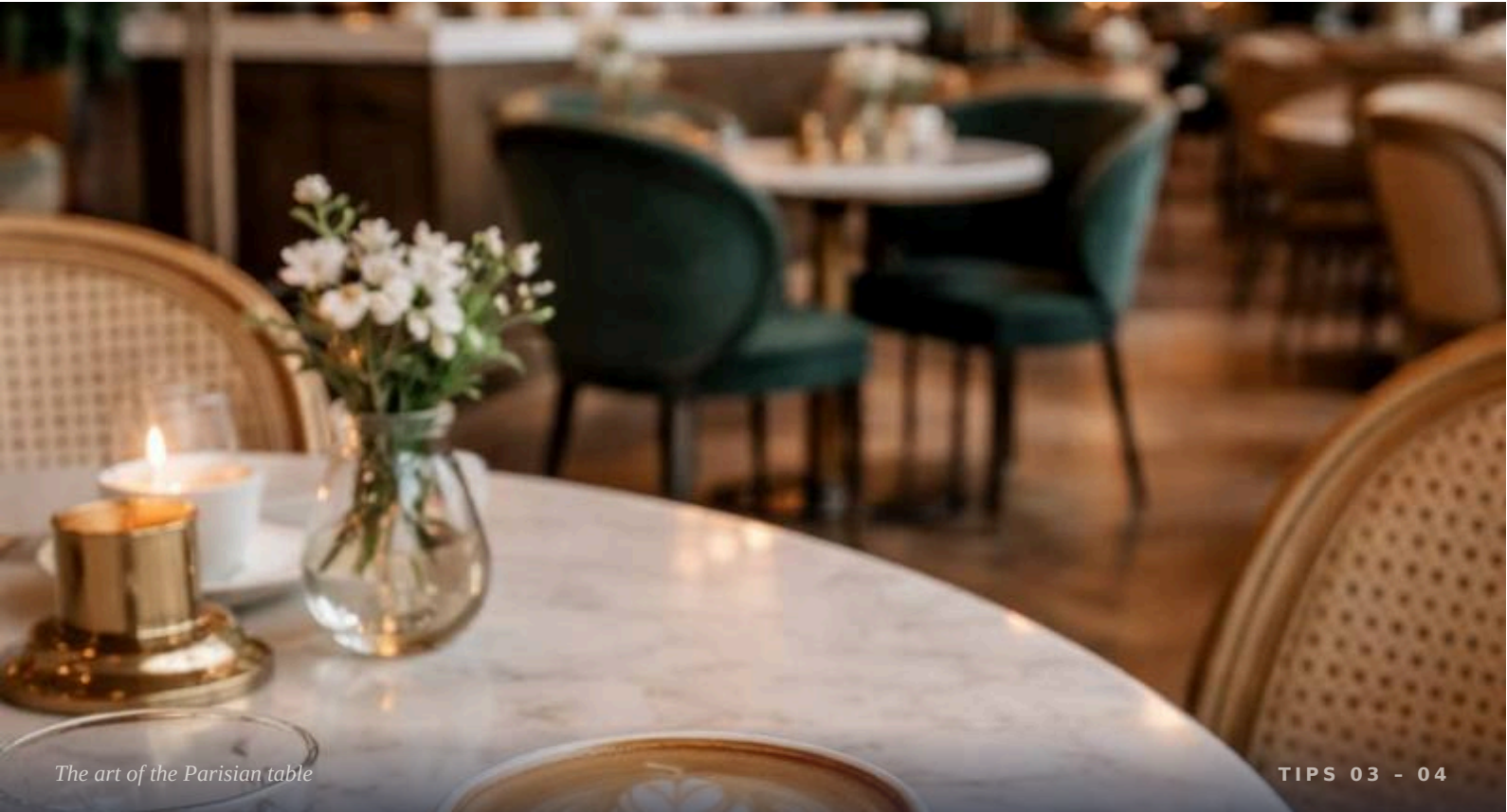
The art of the Parisian table